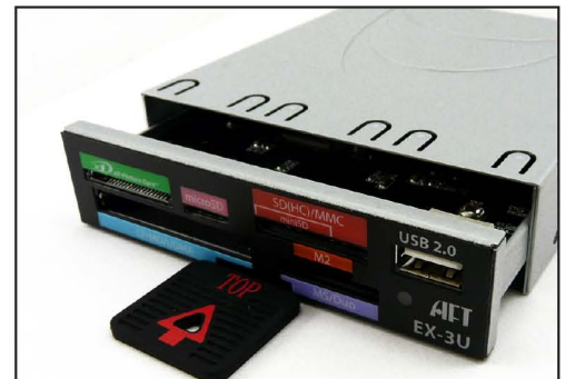
Service Key to eject Reader Cartridge