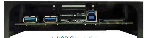
> USB Connection