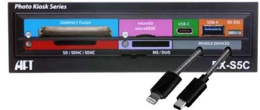
> Smart Cables for Mobile devices (23cm Length from bezel)

Other certifications or licenses not shown can be done by customer requests Specifications are subject to change without further notice. All trademarks, trade names and copyrights are properties of their respective owners. Patents Pending in the U.S.A. and/or other countries USA: 6,705,878 ; 7,066,392 Germany : 202005004854.2 Japan: 20310488.9, 20078122, 20077940 Taiwan: 200520028275.2, 96213226, 96213227, China: 200720094655.5, 200720094654, 94201094